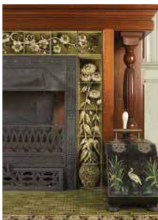
LEFT A handful of British and American companies make glazed tiles similar to these Aesthetic tile panels in a Victorian mansion. RIGHT Square mosaics, a Moravian Brocade deco, and an encaustic floor tile.