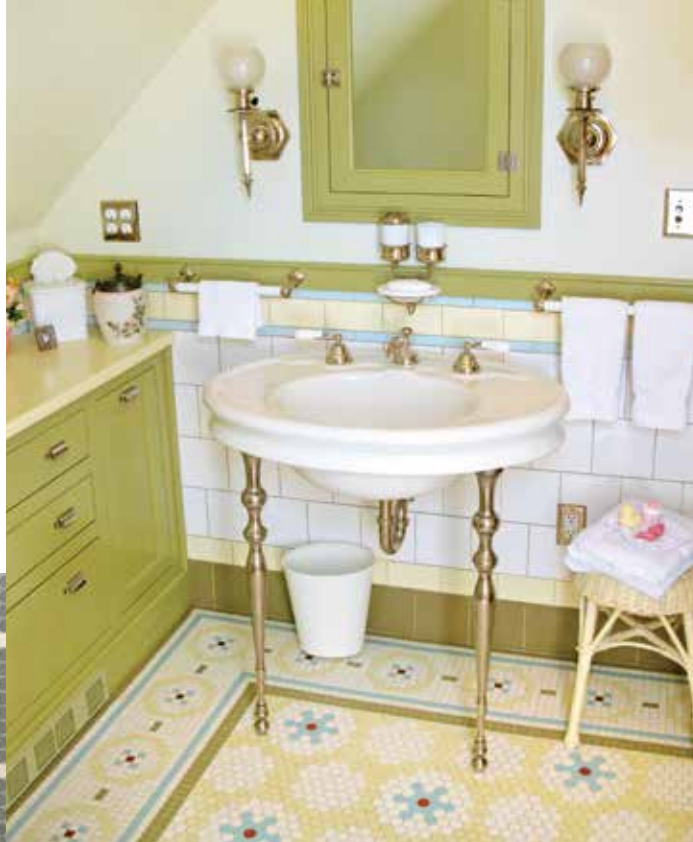
LEFT Using color to create pattern, this floor of hexagon and square mosaics was designed by Bo Sullivan, who may have channeled the more whimsical suggestions depicted in tile manufacturers' catalogs ca. 1905–1912. FAR LEFT A basketweave pattern (this variant is called wicker-weave in old catalogs) and hex tiles; mosaics extend to penny rounds, octagons, squares—and endless layout patterns.